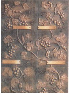
Bronze faceplate detail

St. John's columbarium has a capacity of 136 niches, with bronze faceplates. The alcove surrounding it echoes the carved wood details in the church. The original altar rail separates the columbarium from the rest of the chapel and accommodates a kneeling space along its width. The sides of the columbarium will be finished with wood panels and trim.